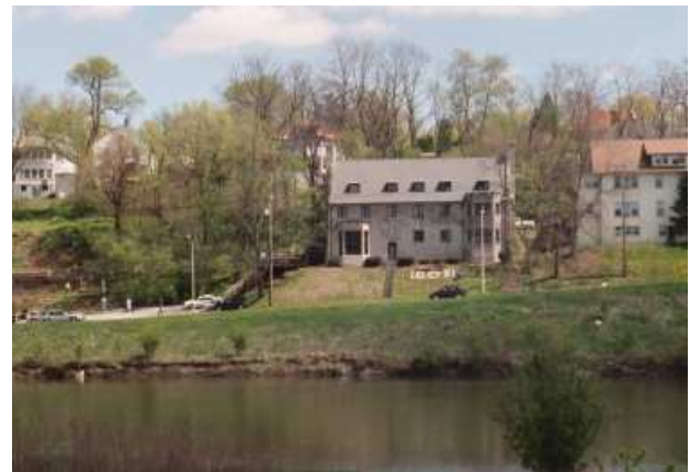
Return to Iowa City and visit the newly renovated Beta House!